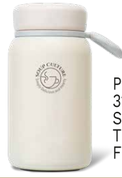
Premium 316 Stainless Steel Thermal Flask