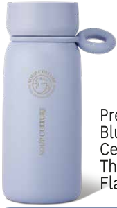
Premium Blue Ceramic Thermal Flask