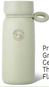
Premium Green Ceramic Thermal Flask